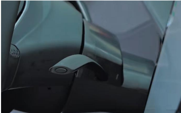
14. Installation complete.