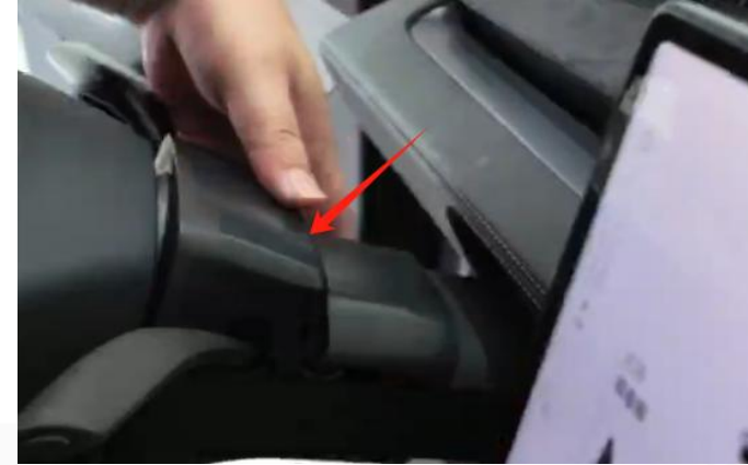
13. Reinstall the steering column trim panel.