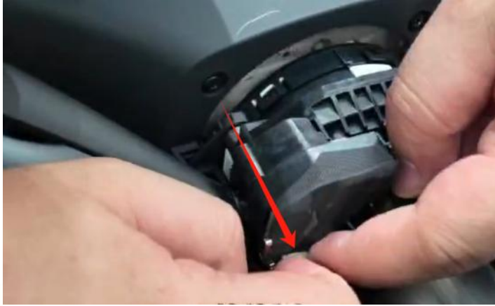
12. Plug in the main lever harness.